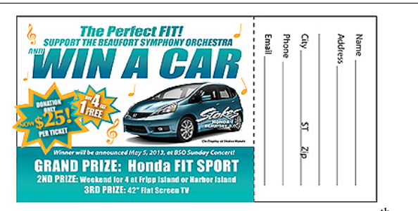
Drawing at the Side-By-Side Concert, May 19<sup>th</sup>.

Beautiful Beaufort, Pearl of the South is available at Breakwater Restaurant and Bar, Carteret Street, Beaufort, and South Main Street, Greenville, and at all Beaufort Symphony Orchestra performances. It is also available at Seaside Getaways, 1551 Sea Island Parkway, Modern Jewelers, Bay Street, the offices of Dr. Bliley, Belleview Park, and online at www.starbooks.biz.