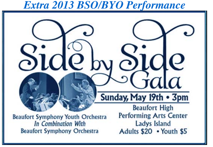
Beaufort, South Carolina

Never before, perhaps never again, both Symphony Orchestras, side by side. Don't miss it! May 19<sup>th</sup>, Beaufort High School Performing Arts Center, Lady's Island and May 21<sup>st</sup>, Sun City. Tickets $20.00; available for purchase from Board members or through TIX on-line on our website. Also at the door.